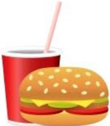
restaurants/ grocery stores